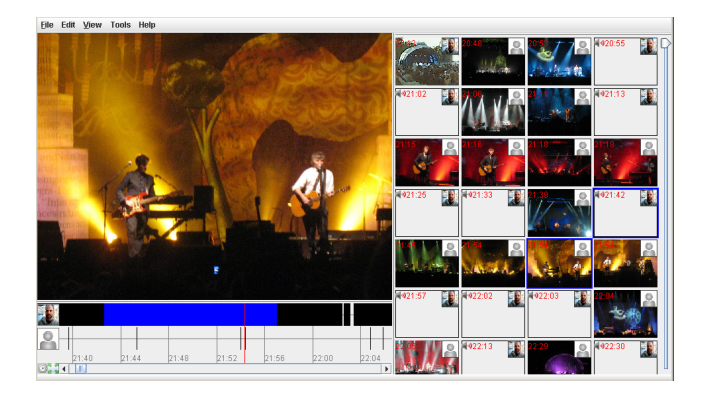
Figure 4: Ad-hoc media fusion in the Geode media viewer. Audio stream is mixed with another users' photo-stream using synchronised playback.

Figure 3 depicts notorious sword-swallower Matty Blade busking in Fremantle's Henderson Street mall. The images are from three separate users, synchronised via Geode's media viewer. The top left frame is a video stream, the other frames represent photos from two other users. The time-