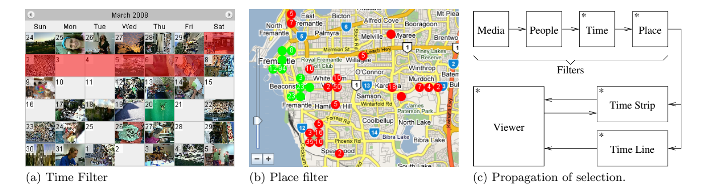
Figure 2: (a) and (b) show examples of Geode filter interfaces. (c) Shows the propagation of selection through filters to viewer. Components marked '*' have visual interfaces that present their inputs to the user.