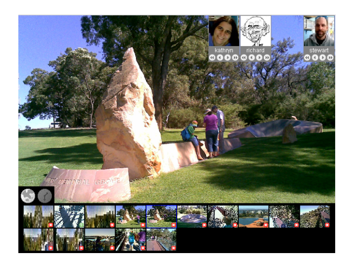
Figure 5: Two modes of the time-strip : sequential and event display.

Figure 6: Context display showing the media producer (top right) and other people present. The filmstrip at the bottom shows related images.