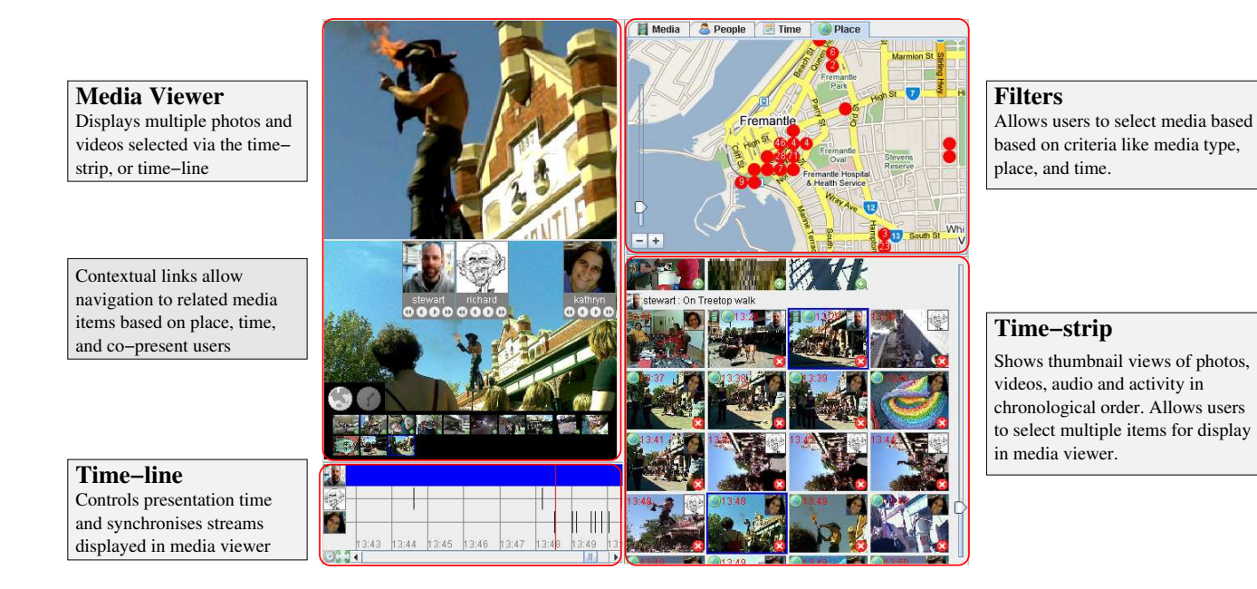
Figure 1: Browser layout showing spatial filter (top right), time-strip (bottom right), media view (top left) and time-line (bottom left). The display shows two perspectives of an event taken by different observers. The images from video and photo streams are synchronised via the media view time-line.